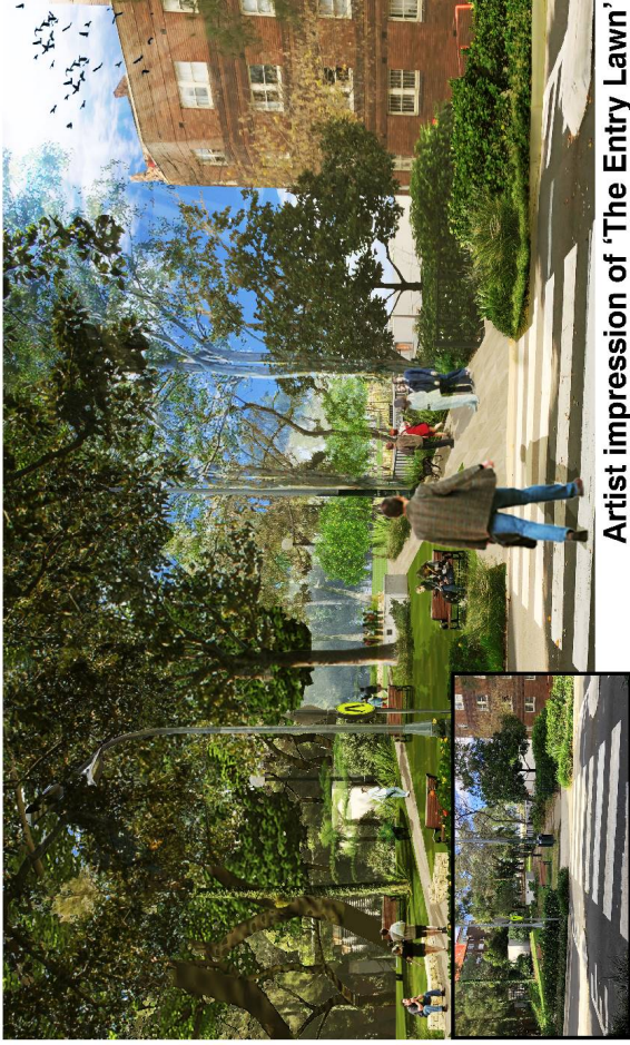
Artist impression of 'The Entry Lawn'