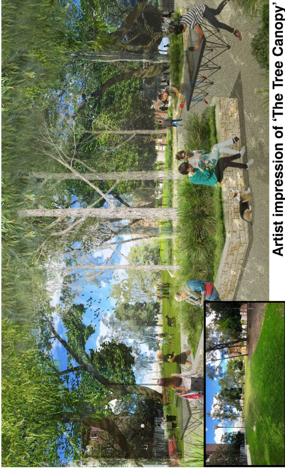
Artist impression of 'The Tree Canopy'